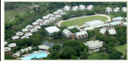
The Prem Center in Chiang Mai, Thailand.

The workshop will be held at the Prem Center for International Education ( www.premcenter.org ). The Prem Center, established in 2000, is beautifully situated on a 90 acre campus in the foothills of the mountains of northern Thailand. It is 20 kilometers north of Thailand's second city Chiang Mai and just over a half hour drive from Chiang Mai International Airport. Accommodation is on campus in two bedroom (ensuite) apartments.